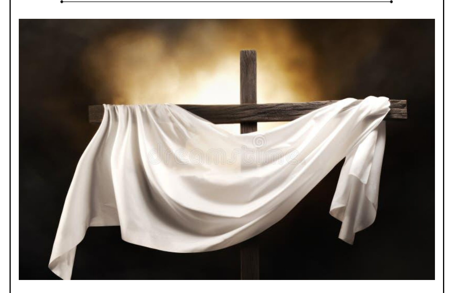
"The meaning of different colors on the cross" Easter Sunday.

The cross is draped in white on Easter Sunday, representing the resurrection of Christ and that He was "...raised again for our justification.